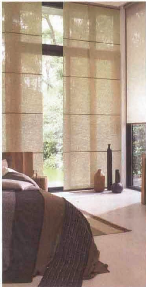
above An earthy palette adds warmth to a timeless Oriental-inspired scheme while floor-to-ceiling Japanese Design panels ensure privacy. A 150cm by 70cm version is priced from £210, at Luxaflex. Tel: 0161 442 9500. www.luxaflex.co.uk

From cosy eclecticism to structured simplicity, your bedroom is an escape from the busy world outside, so create a comfortable look you enjoy. ■