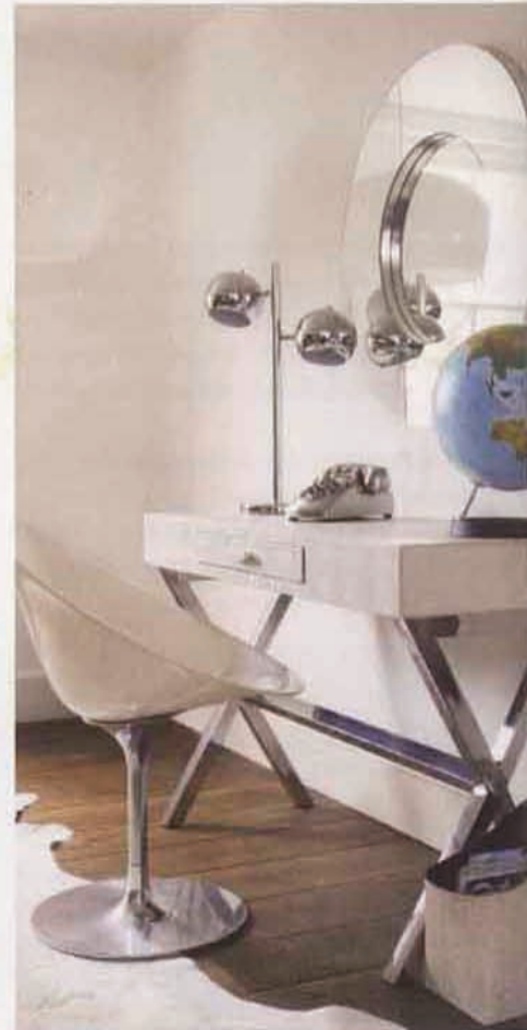
above Quirky influences contrast with the sleek lines, chrome base and faux snakeskin finish of this console table, £375. The Eros chair costs £279 and the Retro Ball lamp, £52, at Graham & Green. Tel: 0845 130 6622. www.grahamandgreen.co.uk