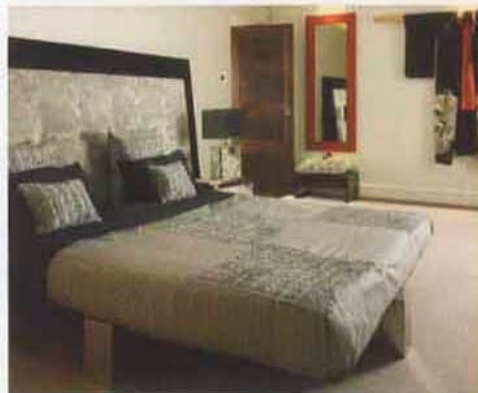
above Tusk International has converted the former Halcyon Hotel into 12 luxury apartments comprising a mix of minimalist and contradictory antique pieces. Prices are available on application. Tel: 020 8785 3077. www.halcyonw11.com