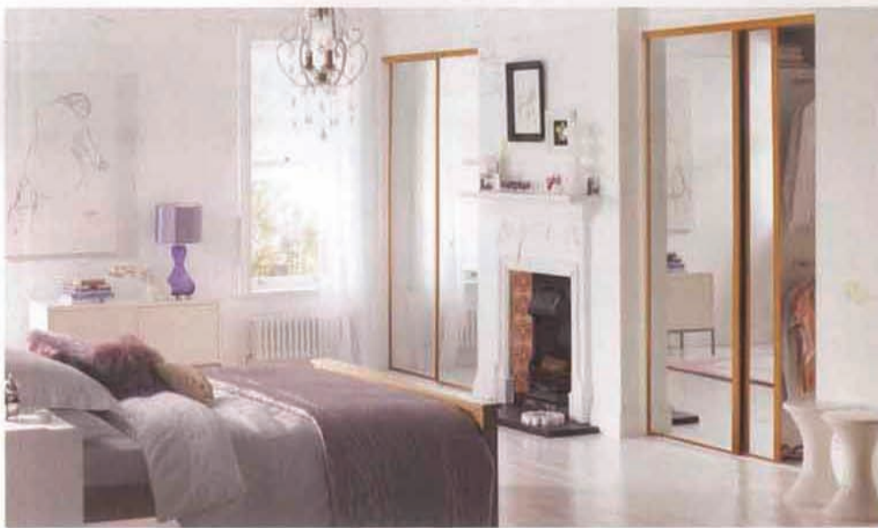
above Built-in wardrobes conceal clutter while accessories add pretty decoration. Expect to pay £800 for a made-to-measure kit, at Deane Direct. Tel: 01329 827817. www.deanedirect.co.uk