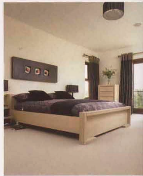
above In this cosy boudoir, chunky wooden furniture offers a smart feel and Dubai carpet creates comfort underfoot. Prices on request, at Ulster Carpets. Tel: 028 3833 4433. www.ulstercarpets.co.uk